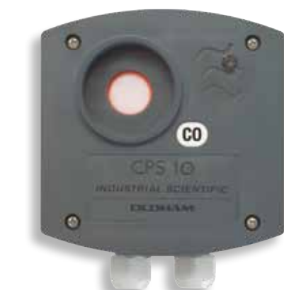
CPS 10 sensor module