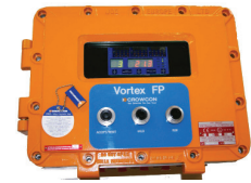
Vortex FP Compact